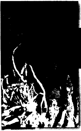
Larva flow: how heat-loving animals find their next hydrothermal vent, p. 545.